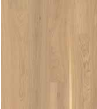
Oak Andante/ Nature