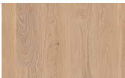
Oak Coral 10036436 / OP4V4MFD