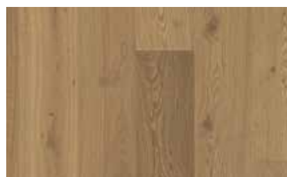
Oak Semi Smoked 10141585 / EO4V43FD