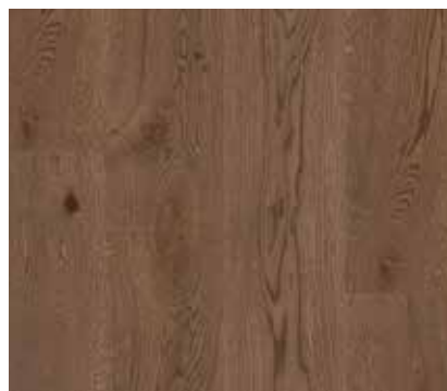
Oak Ginger Brown 10136900 / PN47V3FD