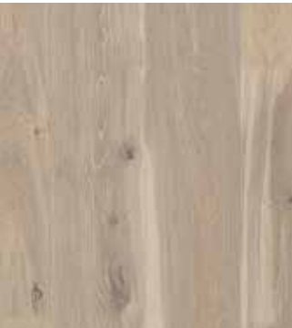
Oak Pale White