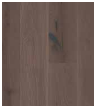
Oak Elephant Grey