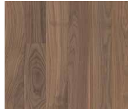
Walnut 10123258 / NS4723FD