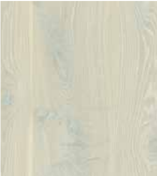
Oak Canyon white