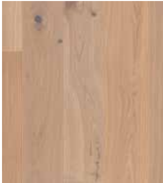
Oak Traditional white