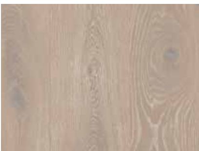
Oak Grey Harmony 10142766 / PBCYV3WD