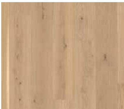
Oak Country 10141588 / EB4743FD

Minimum length of twin surface is 600mm or 24 inches. We can only deliver complete packages