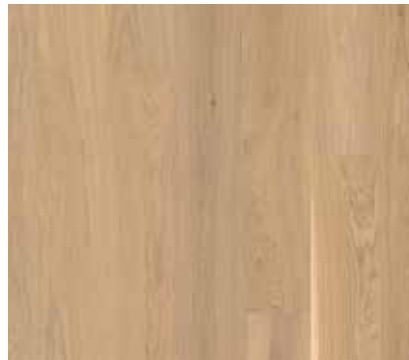
Oak Nature 10117080 / EB4733FD