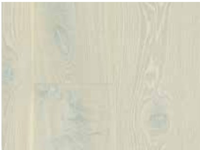
Oak White Canyon 10142747 / EBCYV6WD