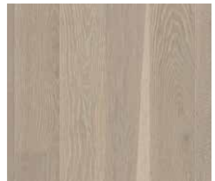
Oak Grey Harmony 10136898 / PB4743FD