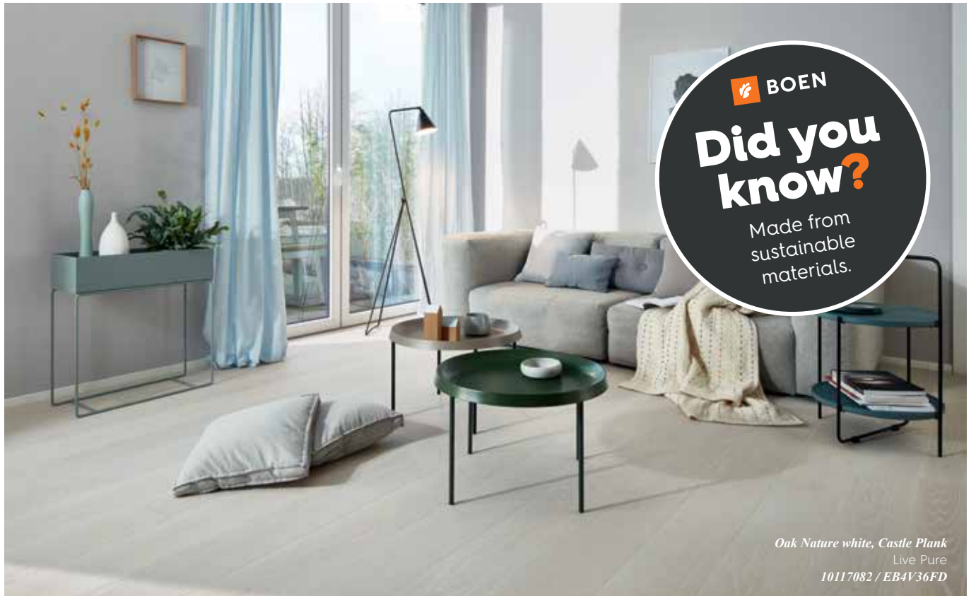
Oak Nature white, Castle Plank Live Pure 10117082 / EB4V36FD