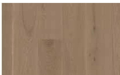
Oak Sand 10036525 / XH4V4MFD