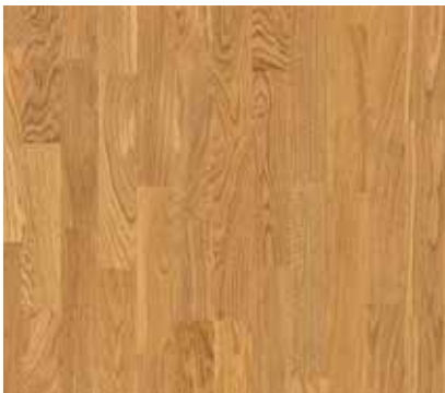
Oak Andante 10041562 / EIHL35TD

1 carton = 6 boards = 30.56 sq. ft. = 52 lb, 1 pallet = 50 cartons = 1528 sq. ft. = 2600 lb. We can only deliver complete packages.