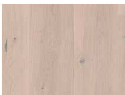
Oak Pearl 10036573 / ORCY4MFD