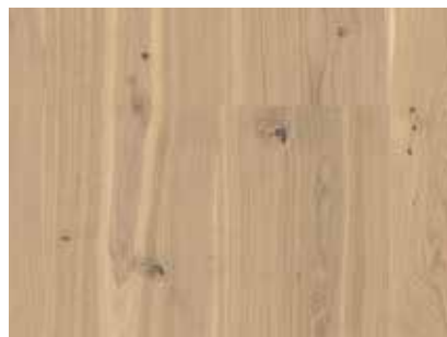
Oak Canyon 10142744 / EBCYV3WD