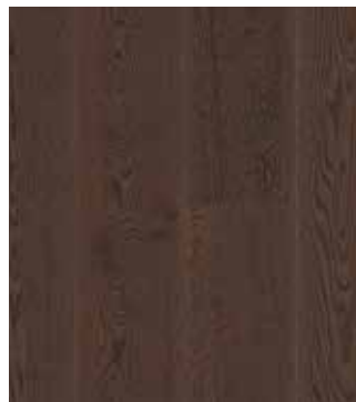
Oak Brazilian Brown