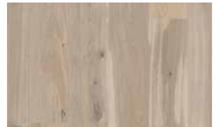
Oak Pale White 10123228 / PI4VV6FD