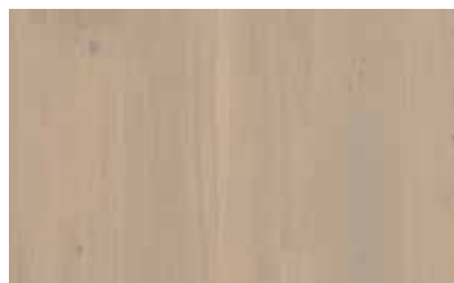
Oak Warm Cotton 10123248 / PE4V43FD