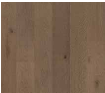
Oak Arizona 10152598 / FFG8K4FD