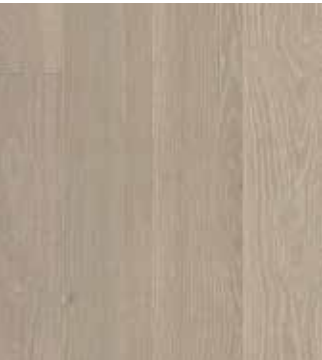
Oak Grey Harmony