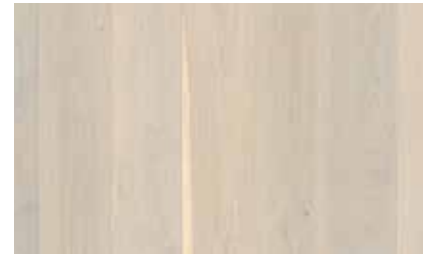
Oak Nature White 10117082 / EB4V36FD