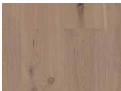
Oak Sand 10036585 / XHCY4MFD