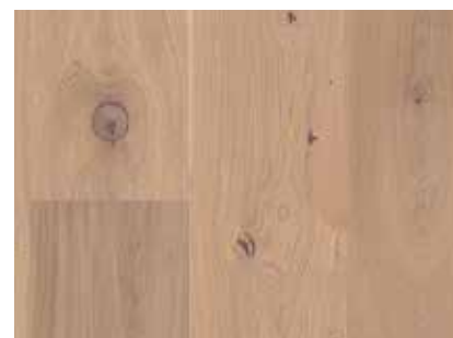
Oak Traditional, unfinished 10041935 / EICY4UPD