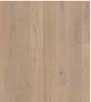
Oak Fresh White