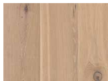
Oak Coral 10036569 / OPCY4MOD