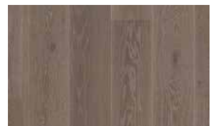
Oak India Grey 10123253 / PH4V43FD