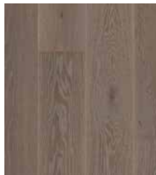
Oak India Grey