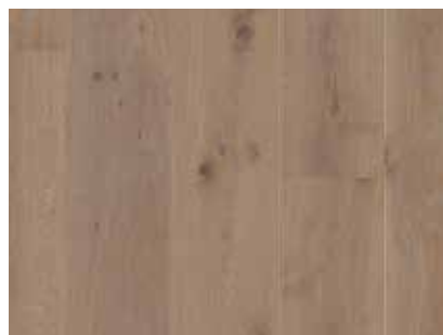
Oak Warm Grey 10142767 / PKCYV3WD