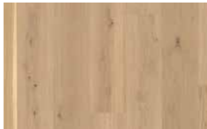
Oak Country 10117088 / EB4V43FD