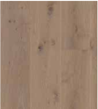
Oak Warm Grey