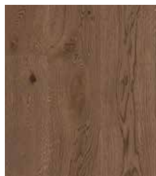
Oak Ginger Brown