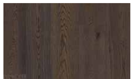
Oak Brown Jasper 10109233 / XZ4VVKFD