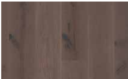
Oak Elephant Grey 10136409 / PM4VZ3FD