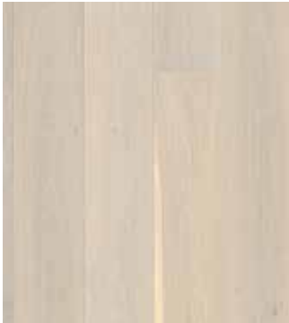
Oak Nature white