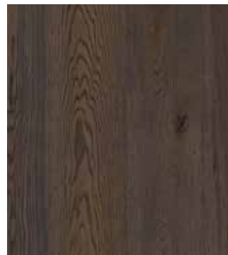
Oak Brown Jasper