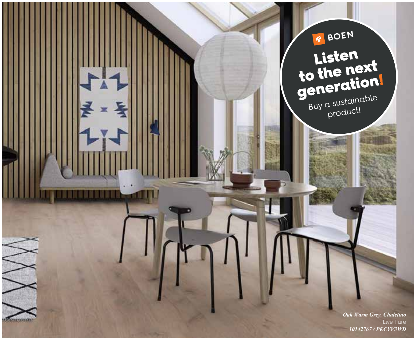
Oak Warm Grey, Chaletino Live Pure 10142767 / PKCYV3WD