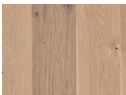
Oak Traditional White 10036551 / EICY4MFD