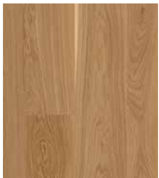
Oak Andante/ Nature