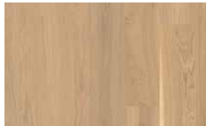
Oak Nature 10117107 / EB4V33FD