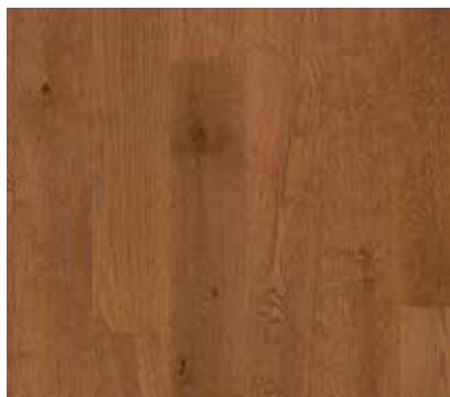
Oak Toscana 10152600 / FGG8K4FD