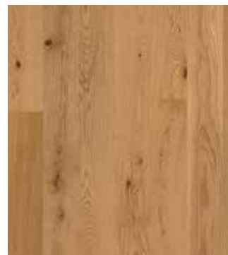
Oak Soft Brown