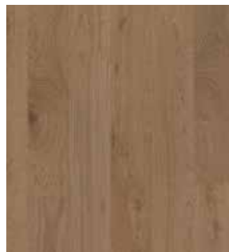
Oak Medium Grey