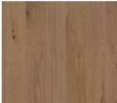
Oak Medium Grey 10152606 / FDG8K4FD