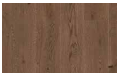
Oak Ginger Brown 10136407 / PN4VV3FD