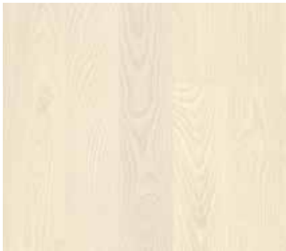
Ash Nature White 10123259 / AD4736FD