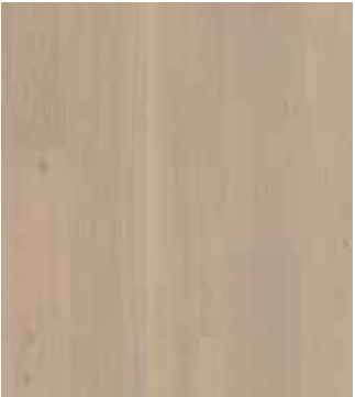
Oak Warm Cotton