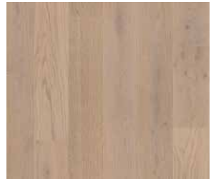
Oak Fresh White 10152604 / FEG8K4FD