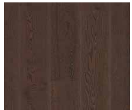
Oak Brazilian Brown 10136899 / PL4743FD