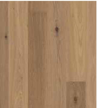
Oak Semi Smoked