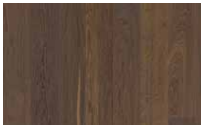
Oak Smoked Nature 10123242 / EE4V33FD