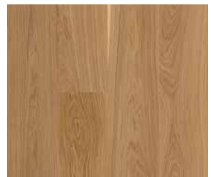
Oak Andante 10036846 / EIG835PD