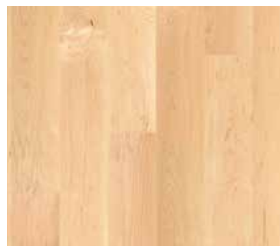
Maple can. Andante 10037077 / MAG835PD