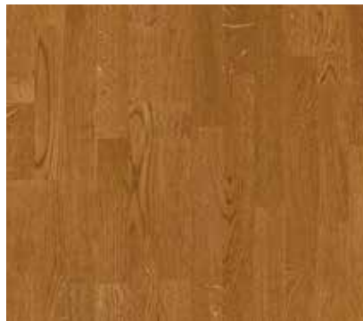
Oak Toscana Andante 10041496 / ETHLT5TD