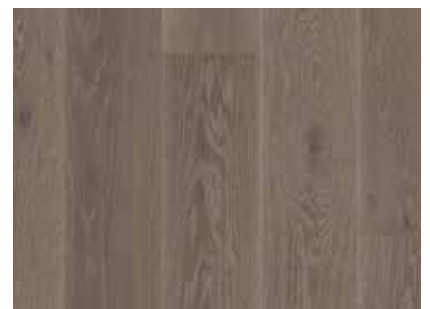
Oak India Grey 10143409 / PHCYV3WD