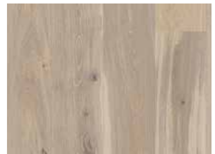
Oak Pale White 10142746 / PICYV6WD