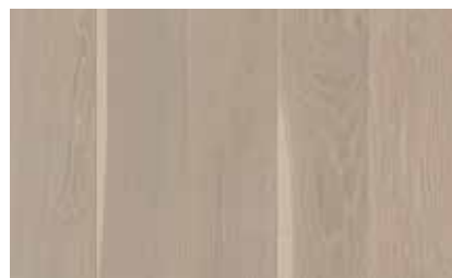
Oak Grey Harmony 10123243 / PB4V43FD