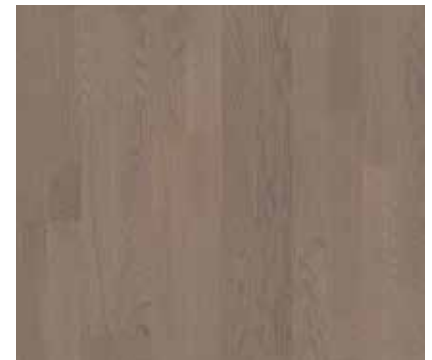
Oak Arizona Andante 10141238 / EQHLT5TD