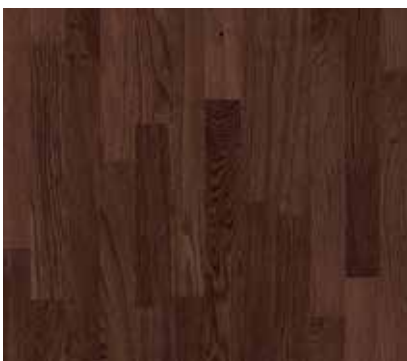
Oak Oregon Andante 10109128 / EYHLT5TD