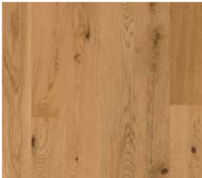
Oak Soft Brown 10152602 / FCG8K4FD