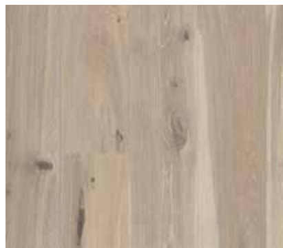
Oak Pale White 10137382 / PI47V6FD