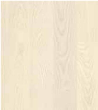
Ash Nature white