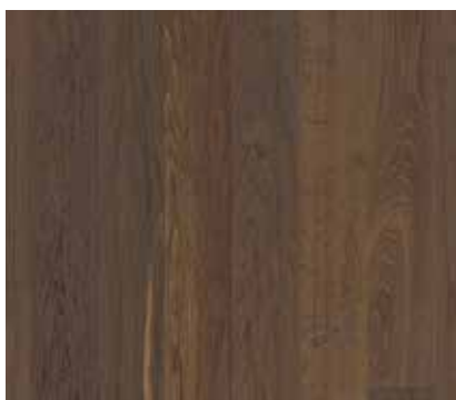
Oak Smoked Nature 10123763 / EE4733FD