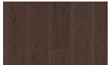
Oak Brazilian Brown 10136405 / PL4V43FD