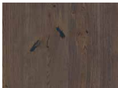
Oak Brown Jasper 10114863 / XZCYVKFD