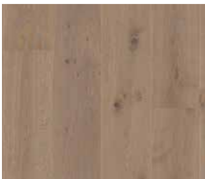
Oak Warm Grey 10136879 / PK47V3FD